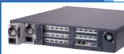
Equipped with 300W Redundant Power Supply