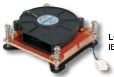
LGA1156 Cooler IEI P/N: CF-1156A-RS